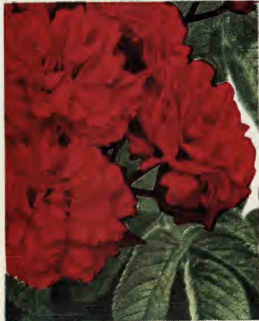
F. J. Grootendorst. Price, each, $1.50, $14.00 per 10.